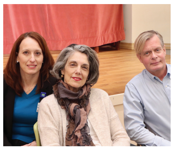
Our panel discusses diversity on the context of end-of-life care planning challenges for various patient populations