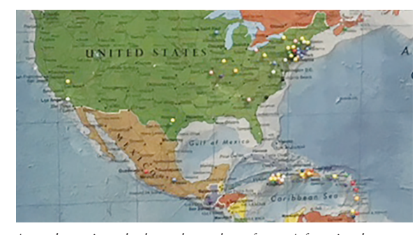
Attendees pinned where they where from. A fun visual activity that show just how diverse we all are.

LGBTQ+ & Sensitive Care —with partnership and education from SAGE Care we are learning how to set industry standards and best practices when caring for the LGBTQ+ community.